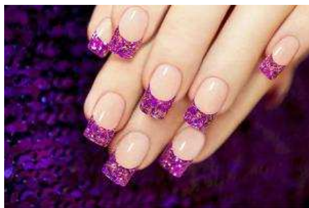
The hottest manicures this season

READ MORE Velvet | Scrubs | Nails | Manicure | Luxury